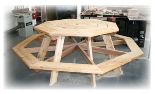
The picnic table that the Technology Club constructed for Student Council

The Technology Club recently completed constructing a circular picnic table for the Holley MS/HS Student Council that will be placed outside the Dining Hall. The students researched several designs and